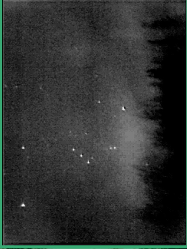
Movie is contrast-enhanced and time-compressed.

After midnight, the aurora appears as patches of light. These patches often look like puffs of smoke or fluffy clouds. Patches are called pulsating aurora when they blink on and off in a regular pattern. The blinking pattern ranges from one or two seconds, up to half a minute.