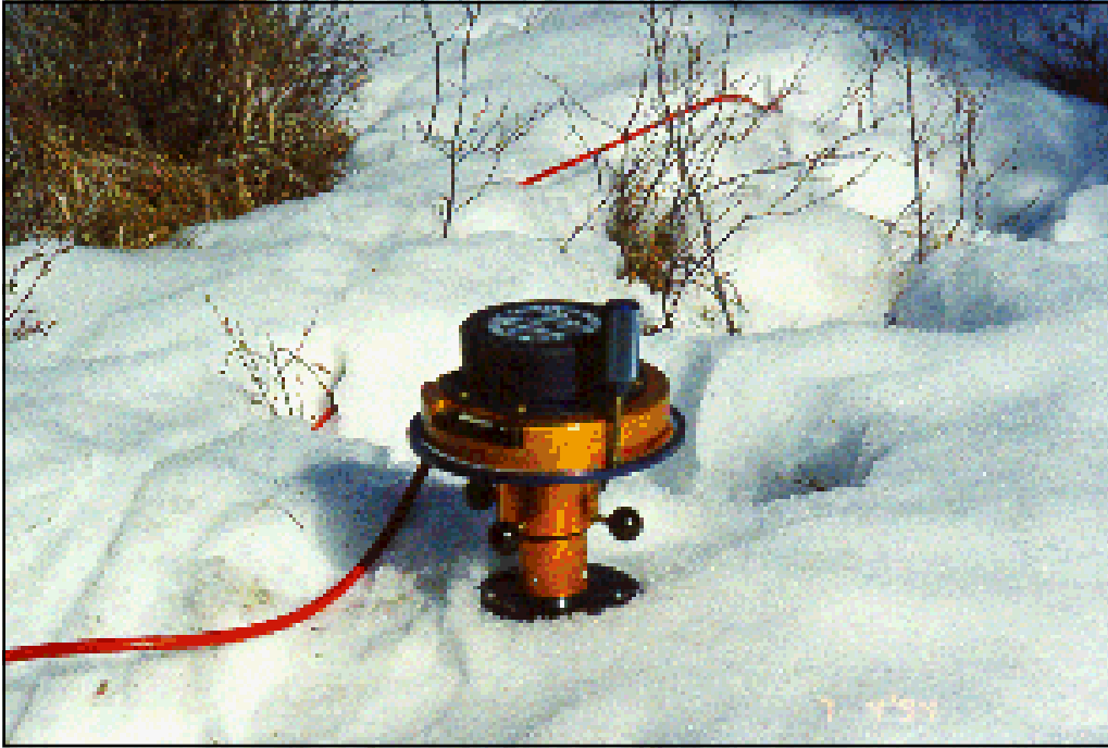
A fluxgate magnetometer measures the strength of Earth's magnetic field.