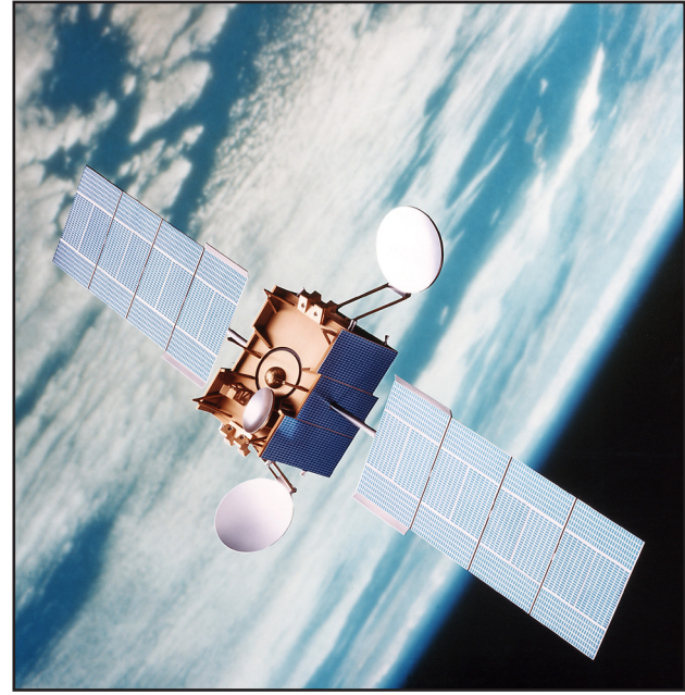
Anik E, launched by Canada in 1972