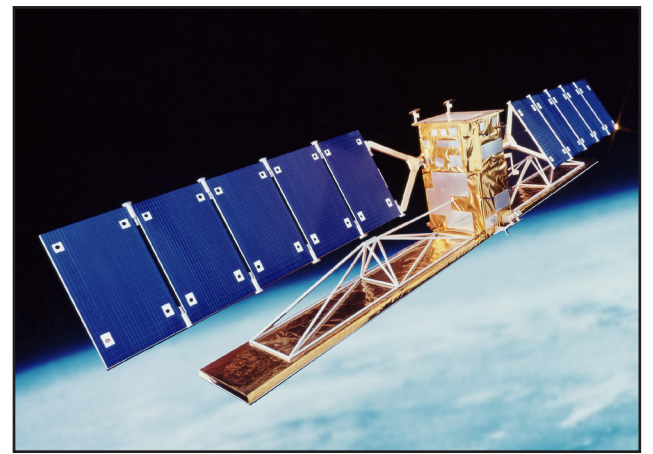
Radarsat, launched by Canada in November 1995