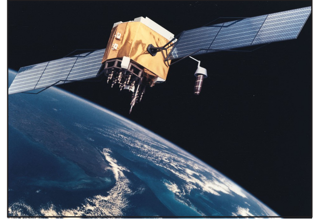
Navstar, launched by the United States Department of Defense in 1978