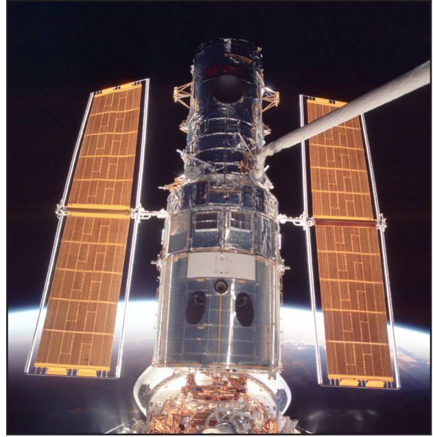
Hubble Space Telescope, launched by NASA in April 1990